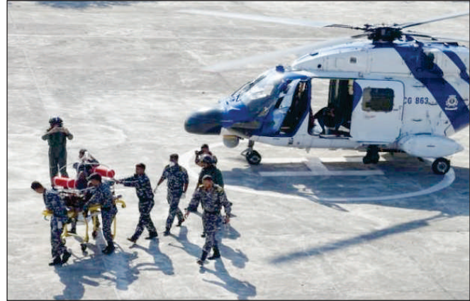
Medical Emergency Onboard Indian Fishing Boat (IFB) Sidheshwari