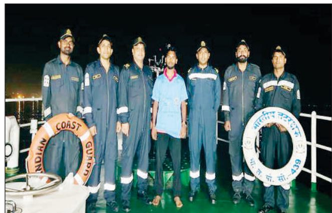
SAR Efforts for Man Overboard From Yacht Macgregor-26