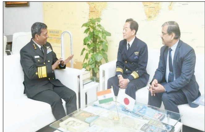
Interaction with Superintendent, Japan Coast Guard Academy