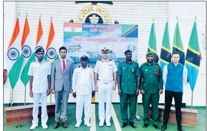
Interaction with Tanzania Maritime Agencies