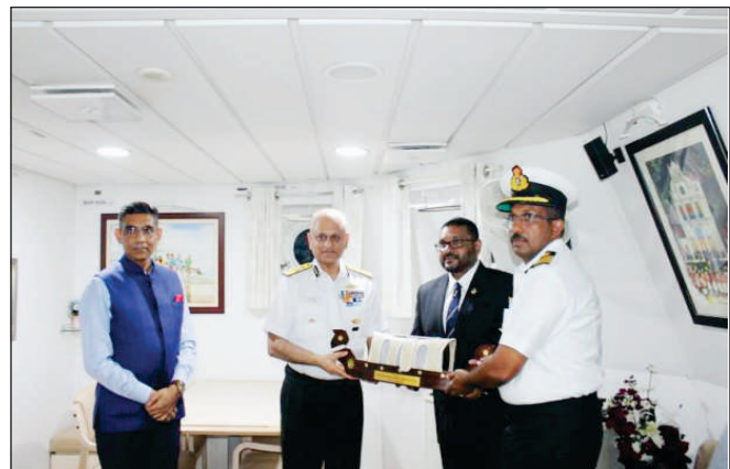
Exchange of Memento