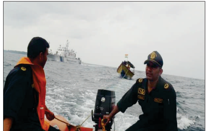
Assistance to Stranded Indian Fishing Boat (IFB) Ganga