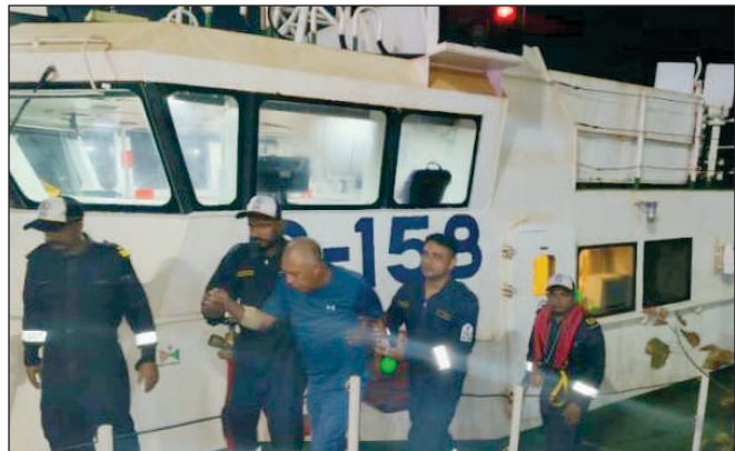
Medical Emergency onboard Passenger Vessel (PV) Celebrity Millennium