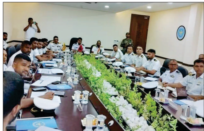
Call on Commandant MNDF CG