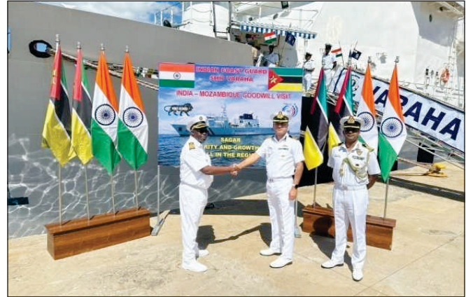
Welcome ceremony at Maputo Port, Mozambique

On 23 Feb 24, ICGS Varaha made a port call at Zanzibar, Tanzania as part of its East Africa overseas deployment. OSD of ICG ship to African countries provided a suitable platform to showcase capabilities of ICG and Indian shipbuilding industry to the African countries.