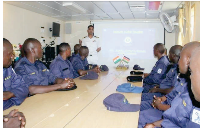
Interaction with Kenya Coast Guard Services