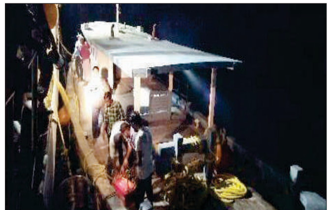
Assistance to Stranded Indian Fishing Boat (IFB) Arul Matha