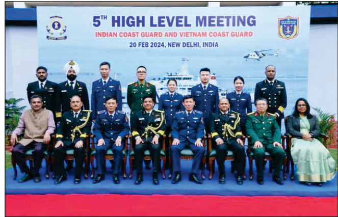
Bilateral Meeting with Vietnam Coast Guard