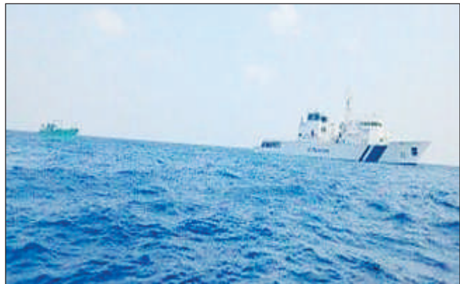
Assistance to Stranded IFB King