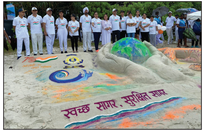
Fig 17. Radhanagar Beach Havelock

The International Coastal Cleanup day is conducted in various parts of the world in third week of September every year under the aegis of