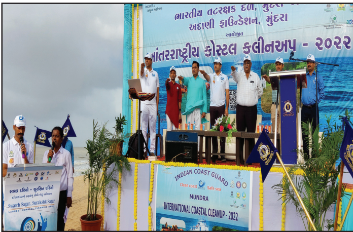
Fig 14. ICGS Mundra