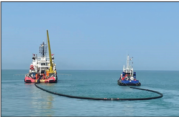
Fig 5. Preparedness for Oil spill combat

Nayara Energy strongly believe that prevention is better than cure. Therefore, all our offshore assets, equipment, and ancillaries comply with strict service life and retirement criteria under classification from ABS. A robust mechanism for oil spill management is in place, comprising of an Oil Spill Disaster Contingency Plan (OSDCP), Tier-I OSR equipment and trained manpower. Mutual Aid Agreement with the Port Authority and nearby Oil handling agencies is also in place for resource pooling.