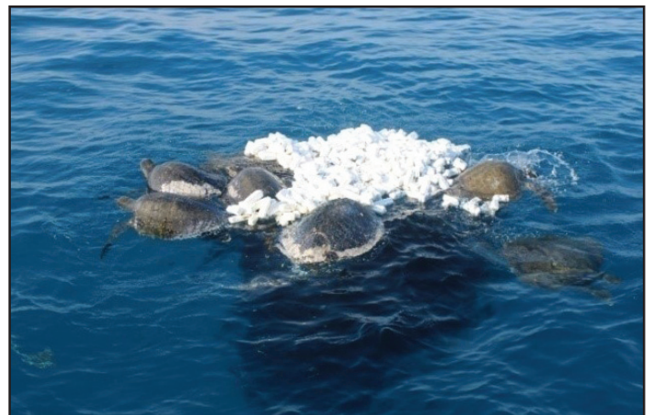
Fig 2. Rescued turtles

Pamban, sighted a considerably large ghost net floating in sea in position 090°01'.78" N 079°16'.94E (166 Pamban Lt 16). On closer observation, around 07 Olive Ridley turtles were found to be entangled in the ghost net. The ship lowered the sea-boat along with Boarding Party. The Boarding party carefully maneuvered close to the ghost net and cautiously started cutting the net to free the turtles one by one. After persistent efforts of about 40 minutes, the Boarding Party freed all the 07 turtles. The ghost net which weighed about 80-90 kg, still posed danger to the marine fauna and was recovered onboard.