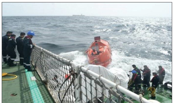
Fig 35. MT Path

MT Parth, Gabonese Republic vessel reported flooding onboard due to water ingress off Ratnagiri, Maharashtra on 16 Sep 22. The vessel was carrying 131.1 MT HFO and 36.67 MT DO. ICG Ships and