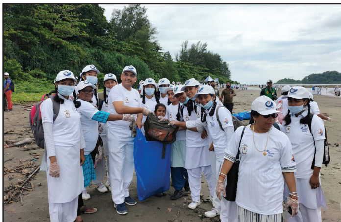
Fig 22. Kalipur Beach