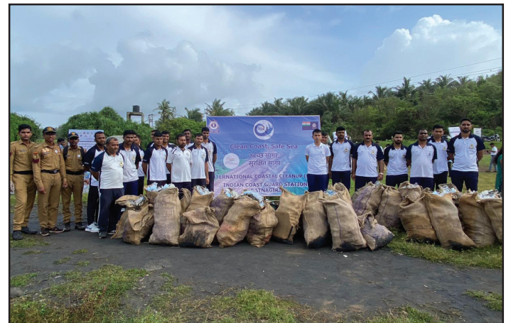
Fig 24. ICGS Ratnagiri