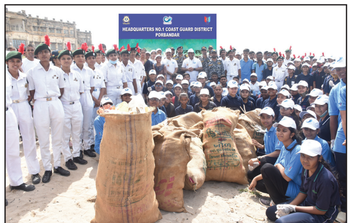
Fig 13. ICGS Porbandar

Taking forward the vision of the Hon'ble Prime Minister and his constant emphasis on cleanliness across the nation including Coastal States/UTs, a cleanliness campaign "Swachh Sagar Surakshit Sagar" and 'Puneet Sagar Abhiyan' was conducted on 17 Sep 2022.