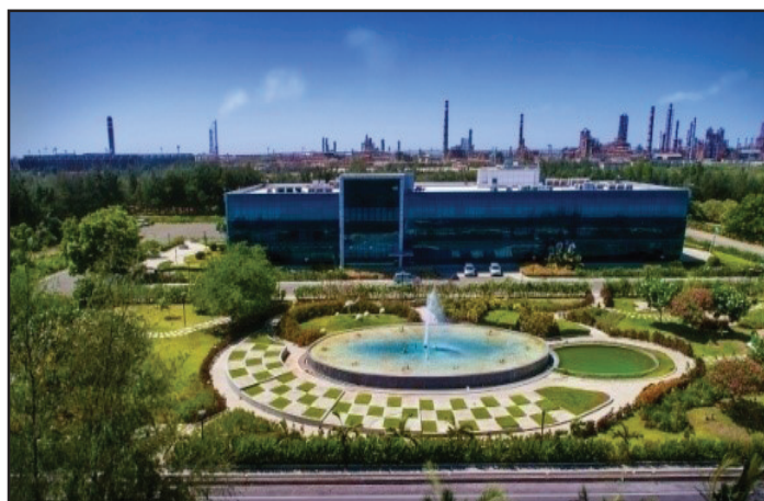
Fig 4. M/s Nayara Energy Pvt Ltd

Nayara Energy is aware of its vast responsibilities, which includes social and environmental duties and has developed well-defined Environmental Management System for mitigating the impacts on the environment. Some of the important measures include: