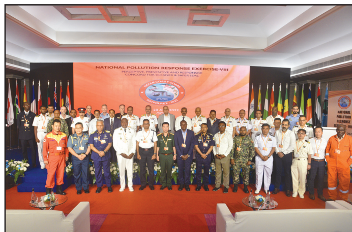
Fig 10. Foreign delegates