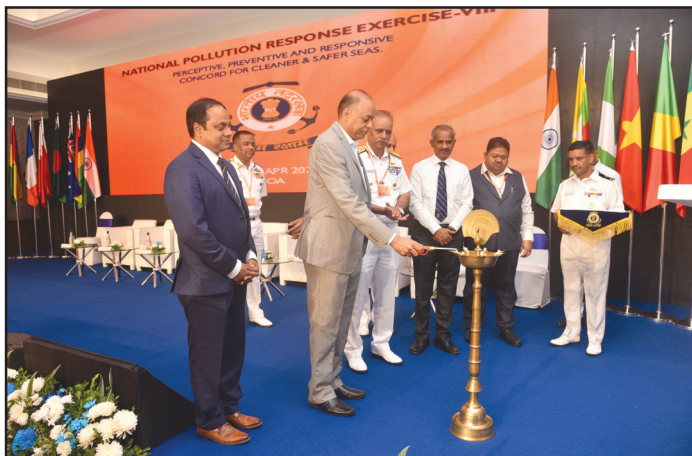
Fig 9. Defence Secretary, Inaugural Session

invitees for the inaugural session by the Chairman NOSDCP. NATPOLREX-VIII was inaugurated by Defence Secretary by lighting of lamp in presence dignitaries on 19 Apr 22 .