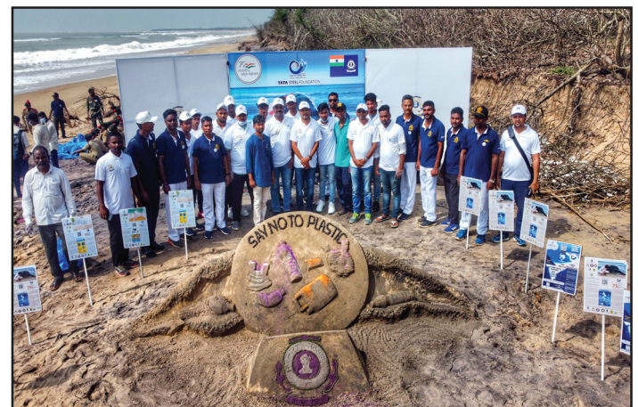
Fig 18. ICGS Gopalpur