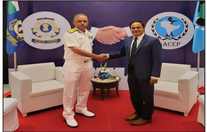
Fig 12. DGICG and DG SACEP

response and preparedness were discussed. The bi-lateral talks also saw participation of ships from SACEP member countries (Bangladesh and Sri Lanka) in NATPOLREX- VIII.