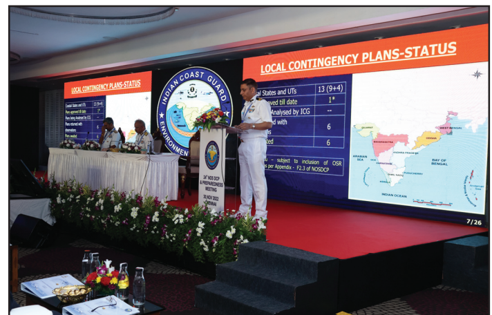
Fig 28. Overview by PD(FE)

During the inaugural address, Chairman NOS-DCP expressed his concern about oil spill incidents. He appreciated efforts of all the agencies in common thread linking our response to each of the oil spill incidents over the years. He highlighted about the national plan is the glue that binds us all together and serves as our guiding light in responding to contingencies. He expressed personal appreciation to all stakeholders for support to contingencies. He commends all the statutory authorities and facilities for the excellent support and cooperation in conduct of joint inspections. He expressed compliment to all the distinguished members for their active participation in the contingency planning process, which is reflected in the action taken report and the agenda proposals.