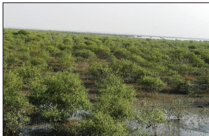
Fig 7. Rich Biodiversity surrounding our operations