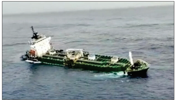
Fig 34. MT Global King 1

On 06 Jul 22 MT Global King 1, a Panama flag vessel sank due to flooding onboard in approx