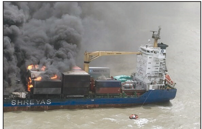
Fig 3. Fire onboard SSL Kolkata

of liability under the applicable national or international limitation regime, but in all cases, not exceeding an amount calculated in accordance with the Convention on Limitation of Liability for Maritime Claims, 1976.