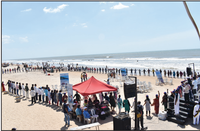
Fig 26. Suryalanka Beach, Nizampatnam

Seema Jagran Manch, Akhil Bharatiya Vidarthi Parishad (ABVP), Paryavaran Sanrakshan Gatividhi (PSG) alongwith other social organisation and educational institutions. The event was conducted with an aim to maintain the sea shores neat and clean and to avoid further pollution of marine environment by man-made activities and also educate and motivate the local populace.