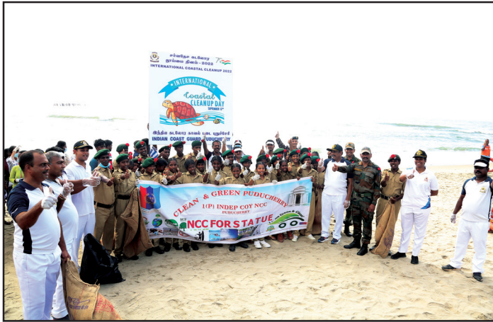
Fig 20. Auroville Beach, Puducherry