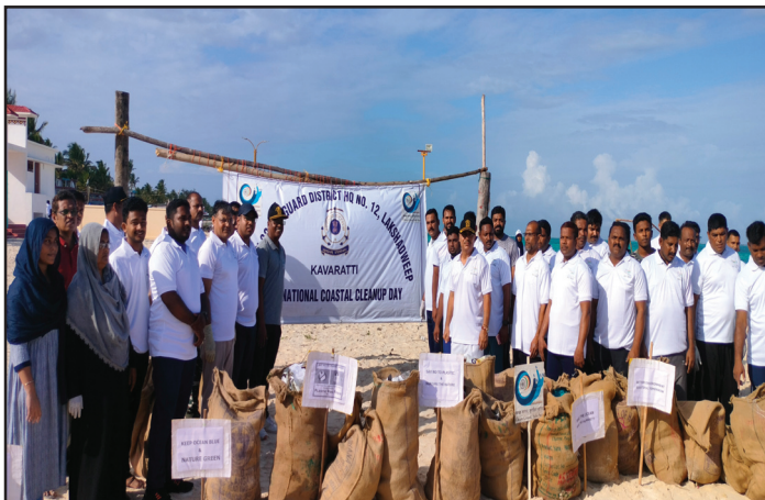
Fig 21. ICGS Kavaratti

Earth Science (MoES), Ministry of Environment Forest and Climate Change (MoEF&CC), Indian Coast Guard, National Service Scheme (NSS), National Disaster Management Authority (NDMA),