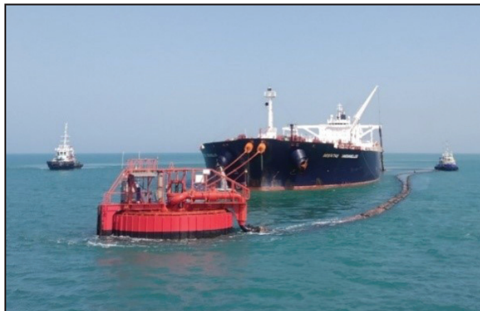
Fig 6. Nayara Energy operations in pristine water

The wastewater from different production units of refinery is collected and treated at the wastewater treatment plant. The entire quantity of treated waste water is reused / recycled for various purposes, such as cooling towers, fire water make-up, green belt, and feed to RO plant. More than 95% of Treated wastewater is reused inside the Refinery.