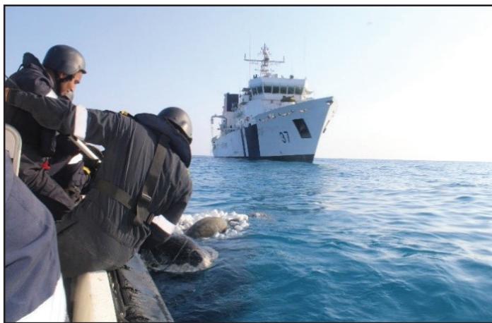
Fig 1. Rescue

Ghost nets can entangle all sorts of marine life. Turtles, owing to its physical features are one of the most vulnerable species to get entangled in these nets. Especially, this concerns the Olive ridley turtles which are endangered species categorised in schedule 1 of Wildlife protection Act 1972.