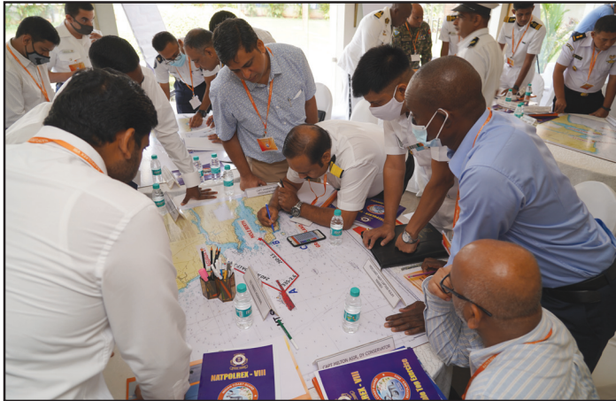
Fig 11. Table Top Exercise

During the ceremony the representative discussed various issues and pollution response capabilities of their countries and participating agencies. The participants displayed keen interest towards the various forthcoming events related to NATPOLREX-VIII.