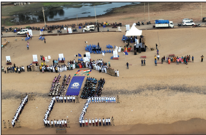
Fig 15. Chandrabhaga

United Nations Environment Programme (UNEP) and South Asia Co-operative Environment Programme (SACEP) in the South Asian Region. The Indian