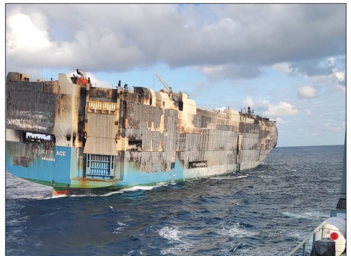
Fig 37. Felicity Ace

Onboard the ill fated vessel were not just any new and used cars, as it turns out. The vessel held 189 Bentleys, 1,110 Porsches, and the very last batch of Lamborghini Aventadors. To fulfill all the final customer orders for the vehicle, the Italian automaker had to restart production of the supercar, which ended not long ago.