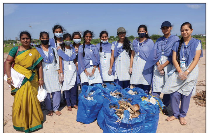
Fig 19. Mallakadu Beach