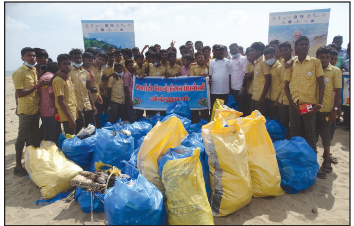
Fig 23. Kilinjalmedu Beach, Karaikal

Coast Guard has been coordinating this activity in India since 2006.