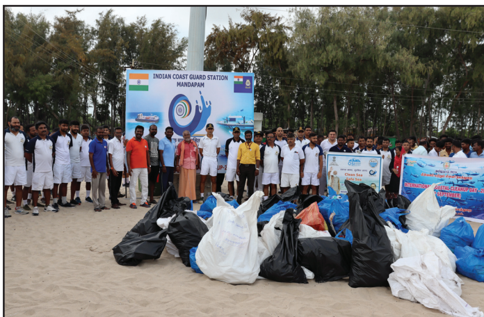
Fig 16. ICGS Mandapam