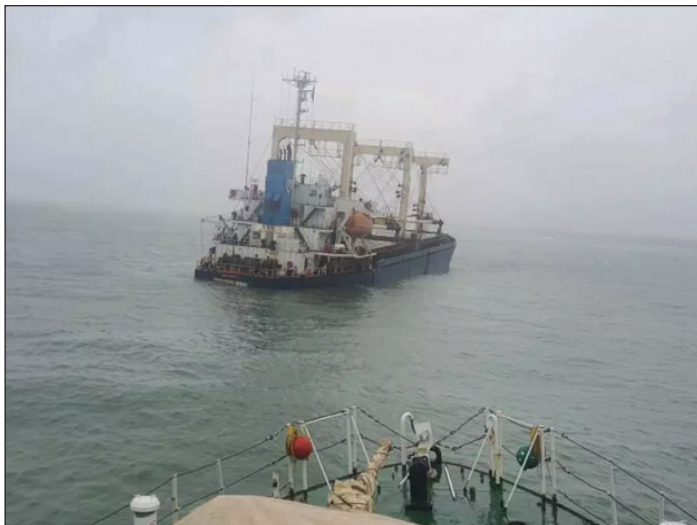
Fig 33. MV Princess Miral

MV Princess Miral, a Belize flag vessel while proceeding to Beirut ran aground off New Mangalore on 21 Jun 22. All 15 crew (Nationality- Syrian) were rescued by ICG units. The vessel had 160 tons of Very Low Sulphur Fuel Oil and 60 ton of engine oil grade LSMGO. ICG surface and air assets at New Mangalore were deployed in PR configuration for undertaking response measures in case of any oil spill. Proactive approach by ICG in ensuring immediate action by all stakeholders resulted in timely commencement of removal of oil from the vessel. The removal of oil with adequate response measures in place to contain any spill, is in progress to ensure protection of marine environment.