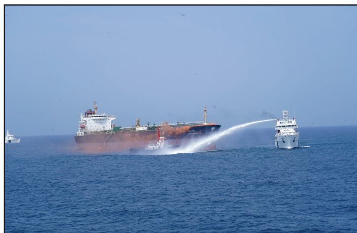
Fig 8. Sea Exercise

Nineteen Friendly Foreign Countries and various international organisation like South Asia Cooperative Environment Programme (SACEP), International Tanker Owners Pollution Federations Limited (ITOPF), M/s Smit Salvage, Desmi etc. participated in the exercise. An Ice breaking ceremony was organised on 18 Apr 22. 22 observers from Friendly Countries and three representatives from International organisations were invited for the ice breaking ceremony held at Goa.