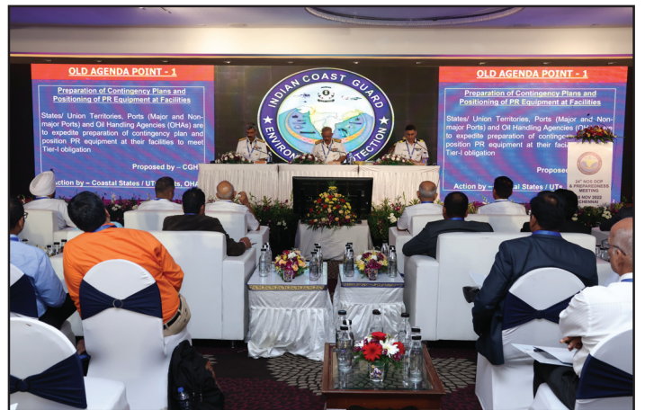
Fig 32. 24 th NOS-DCP meeting

In the concluding remarks, the Chairman appreciated active participation by sharing of professional knowledge from all stakeholders during the proceedings. He also emphasised on cohesiveness amongst stakeholders, frequent interaction and exercises at various levels for sharing of professional knowledge will enhance the robustness of the national system, for meeting the future challenges of pollution response.