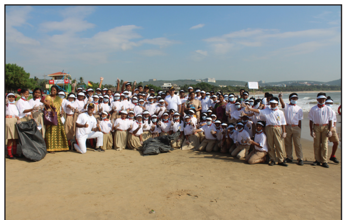
Fig 25. Rushikonda Beach, Vishakhapatnam