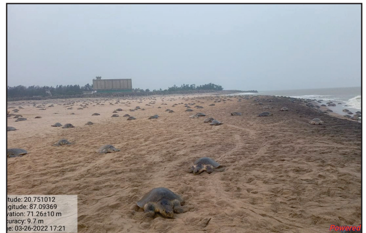
Fig 27. Olive Turtle

conservation. Since the operation is maritime in nature, the Coast Guard also participates in the conservation efforts.