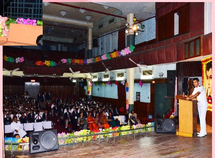
INTERACTION WITH SCHOOL STUDENTS AT KOLKATA