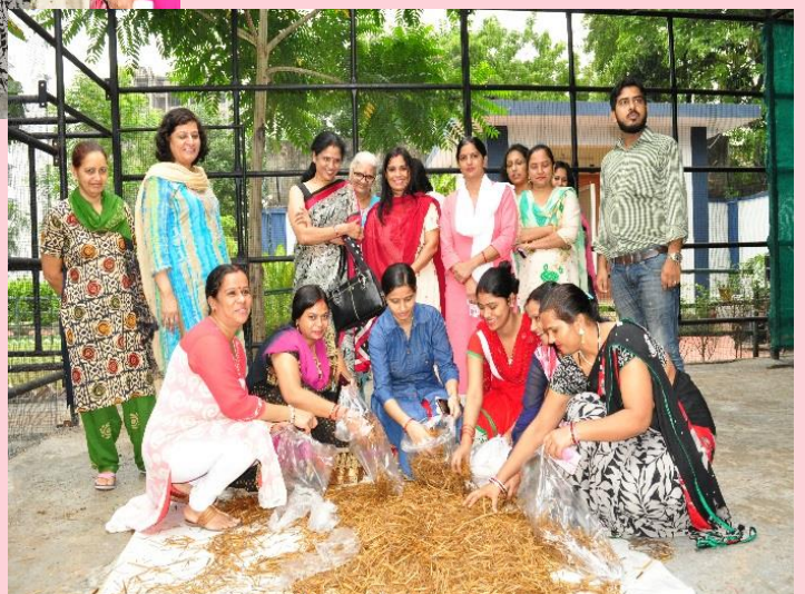
DEMONSTRATION ON MUSHROOM CULTIVATION AT CGRA MANIKTALA