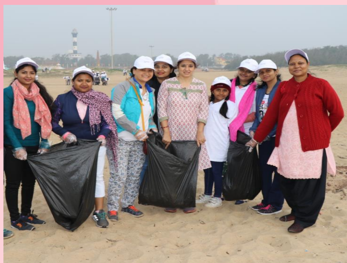
SWACHHTA ABHIYAAN AT PARADIP