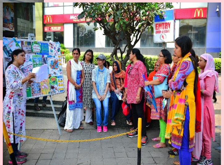
SWACHH BHARAT ABHIYAN AT KOLKATA