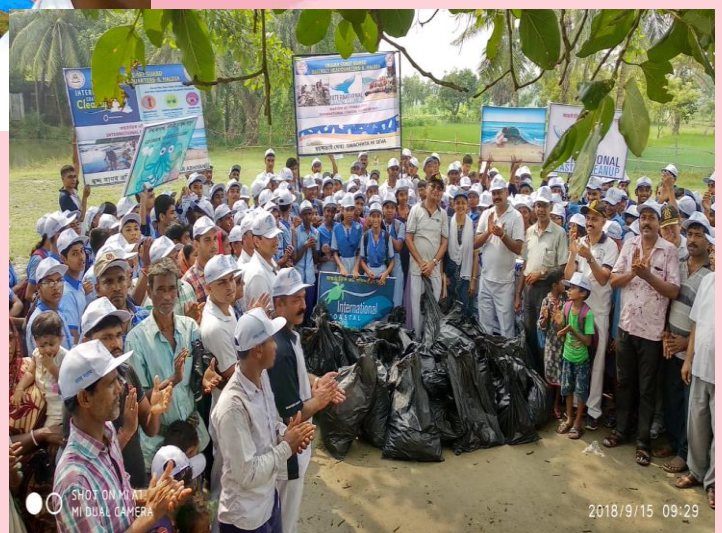
COASTAL CLEAN UP DAY AT HALDIA