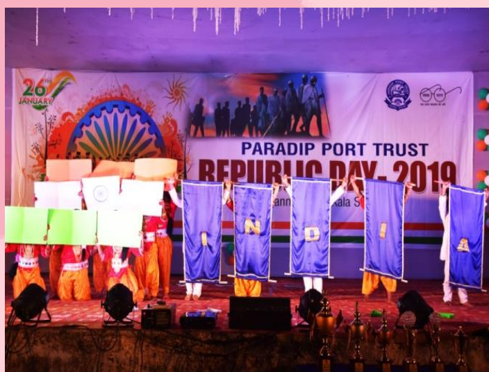
REPUBLIC DAY CELEBRATION CGKG STUDENTS AT PARADIP