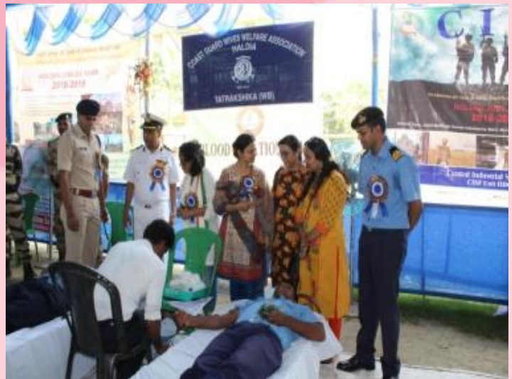
BLOOD DONATION CAMP AT HALDIA