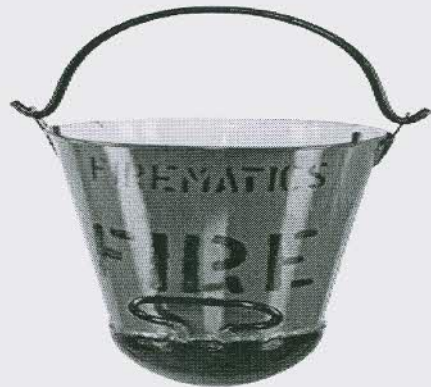
(D) FIRE BUCKET