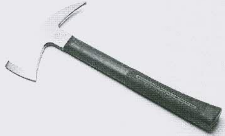
(B) FIRE MAN AXE