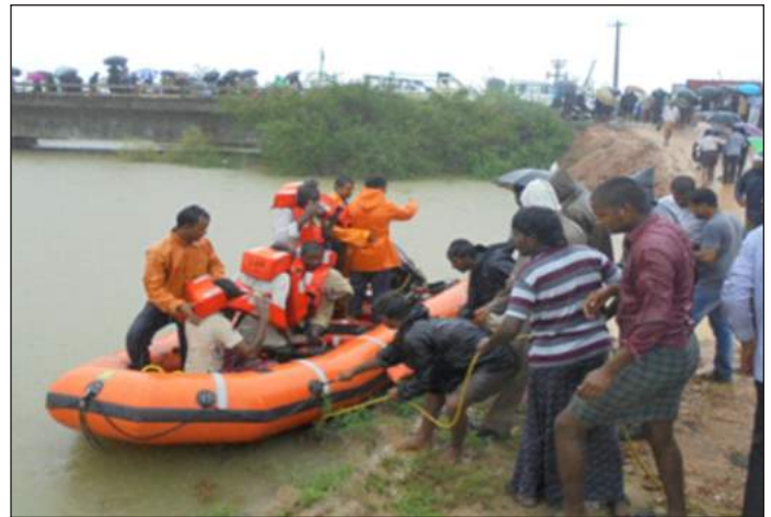
Rescue Operation of Stranded Families, Nellore (AP)

ICG Station Krishnapatnam immediately mobilised the rescue team alongwith Gemini, life jackets and first aid kit. Krishnapatnam Port Authorities and local police too supported the rescue team for mobilization to the area. Upon reaching the area, it was ascertained that 13 persons including 04 women and 03 children had been stranded for over 72 hrs. Using Gemini crafts and life jackets, the Coast Guard team rescued all the stranded personnel and brought them to the place of safety.