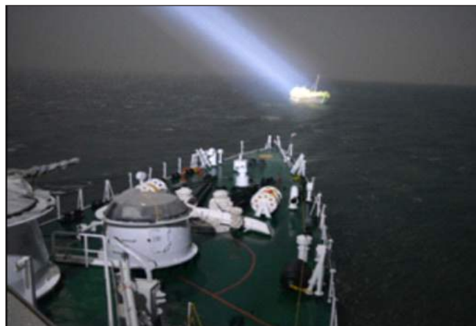
Search and Rescue for Dhow "MSV Sarojini"

At about 1845 hrs on 25 Dec 15, ICG Ship