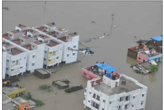
CG Helo on a rescue mission

Intense torrential rains since 30 Nov 15 had caused heavy inundation in and around Chennai. The situation further deteriorated after release of water from Chembarambakkam reservoir into Adyar, resulting in the flooding of the river banks. When the weather forecast predicted incessant rain and formation of a low pressure area in the first week of December, Indian Coast Guard Regional Headquarters (East), Chennai immediately issued an advisory to the State Administration and Fisheries to recall all fishermen at sea and prevent fishing off Tamil Nadu and Andhra Pradesh.