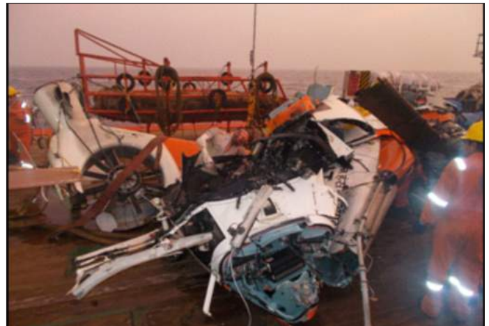
SAR for "Pawan Hans" Helicopter

19 Deg 21.65 N 071 Deg 19.06 E and Fugro Mapper was diverted to undertake advance investigation/ scanning, however, nothing conclusive could be ascertained. 'Samudra Sevak' confirmed later that the transmission was received from underwater locator beacon. Seabed mapping of the area was undertaken by vessels Albatross-19 and Fugoro Mapper close to the position of reported debris without any success. Indian Navy too augmented the sub surface search by utilizing the sonars fitted onboard ships, however, the wreckage could not be located. The search continued for three more days with Indian Coast Guard, Navy and ONGC utilizing the assets in close coordination with each other.