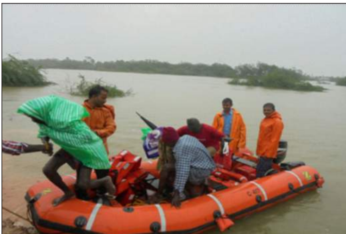
Rescue Operation of Stranded Families, Nellore (AP)

In the early hours of 17 Nov 15, local police at Krishnapatnam intimated Indian Coast Guard Station Krishnapatnam regarding stranded families at Polam Rajugunta Aqua Farms, at Muthukur Mandal, Nellore District. The area had been flooded due to torrential rainfall in southern Andhra Pradesh for last 72 hours and the families were cut off from the main village.