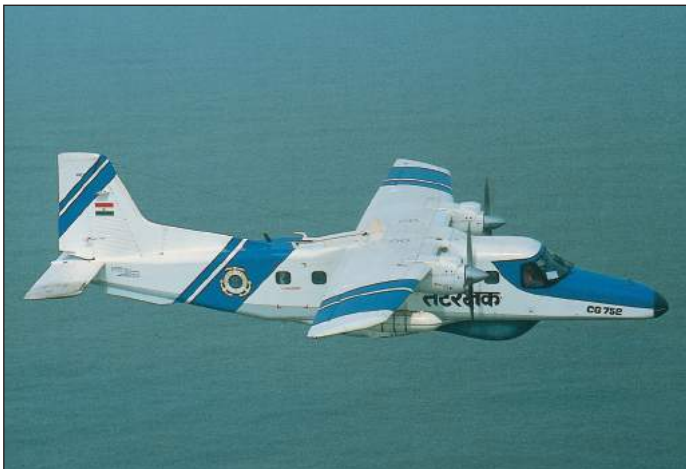
Search and Rescue for CG Dornier

Over 15 surface units, six ICG aircraft, Naval ships and long range maritime surveillance aircraft were immediately deployed for the search operation.