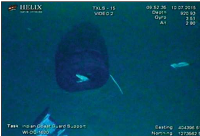
Wreckage spread over Sea Bed

On 02 Jul 15, Coast Guard Air Enclave (CGAE), Bhubaneswar was tasked for the search of a missing boat alongwith 06 fishermen. Despite prevailing weather conditions indicating presence of low and cumulonimbus clouds the Dornier was launched to undertake the search.