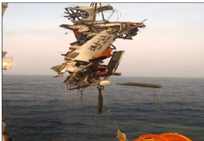
SAR for "Pawan Hans" Helicopter