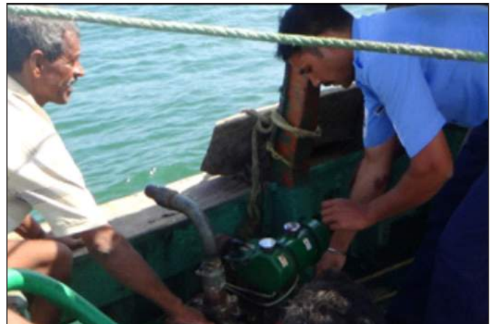
Assistance to FB "Priyanka"