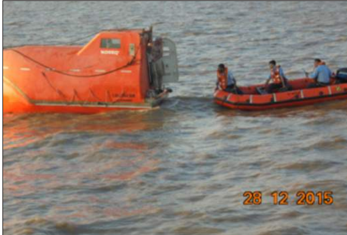
Self Propelled life raft under escort by ICG

C-411, the six crew and lifeboat were planned to be disembarked at Essar jetty by 1500 hrs on 29 Dec 15.