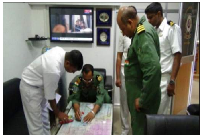
Planning Search and Rescue

It was only after 28 days and persistent efforts that the first actionable transmission from the lost Dornier was picked up by an Indian Naval submarine participating in the search efforts on 05 Jul 15. The submarine received a barrage of transmissions from a depth of 990 meters from the Sonar Locator Beacon of the missing aircraft. M/s Reliance again redeployed its MSV 'Olympic Canyon' and the position was identified. Finally after 33 days of continuous search and persistent efforts, the breakthrough came on 10 Jul 15 with MSV Olympic Canyon able