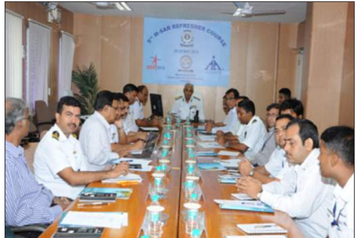
SAR Refresher Course for MRCC/RCC

VGP Salai and Saidapet areas. The overall status of relief and rescue efforts undertaken by Coast Guard is as follows:-