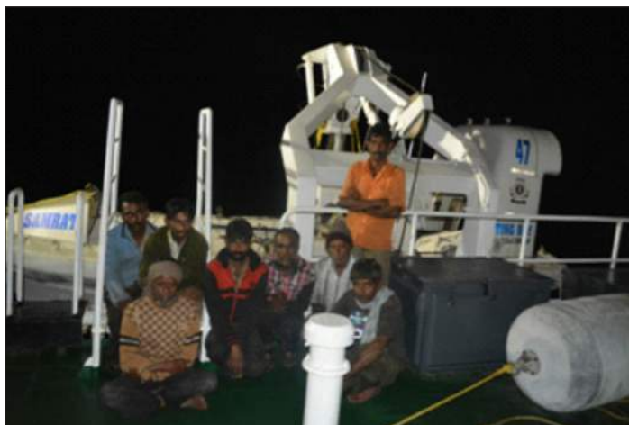
Search and Rescue for Dhow "MSV Sarojini"

ICG Ship C-430 was deployed from Kakinada at 0600 hrs for Search and Rescue. Additionally,