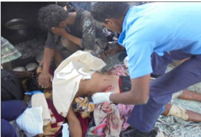
Medical Evacuation from "FB Ganga Prasad"

ICG Ship C-419 was sailed with despatch from Veraval at 1030 hrs and arrived datum at 1430 hrs. C-419 embarked the injured crew and safely shifted him to Pipavav for immediate medical aid. The patient was handed over to Jafrabad Fisheries Association and admitted to local hospital at Mahuva for further medical management.