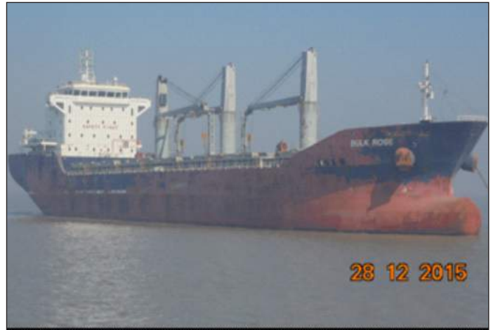
MV "Bulk Rose"

At 1655 hrs on 28 Dec 15, ICG Ship C-411 received a distress call from South Hazira anchorage. C-411 immediately proceeded to the datum and observed that the entire crew of the Bulk Rose had abandoned to a self-propelled lifeboat and was proceeding towards Hazira Port.