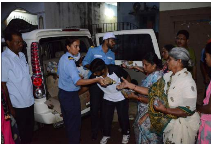
Distributing Relief Material

The classes were conducted on Maritime and Aeronautical Search and Rescue operations. During the course, experience- sharing exercises resulted in enhancement of inter-agency coordination between both operators.