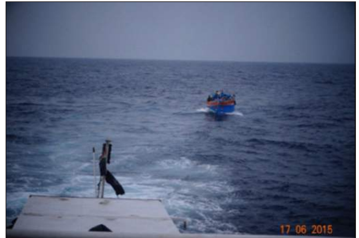
Adrift Fishing Boat “Tata”

Fishing boat ‘Tata’ with 04 crew had ventured into sea at 0600 hrs on 19 Aug 15 from Thankachimadam. At about 0715 hrs on 20 Aug 15, MRCC Chennai received information from Coastal Security Group (CSG), Chennai regarding fishing boat ‘Tata’ adrift in position 24 n miles North East of Pamban, Mandapam. The boat reported flooding in engine room and required immediate assistance.