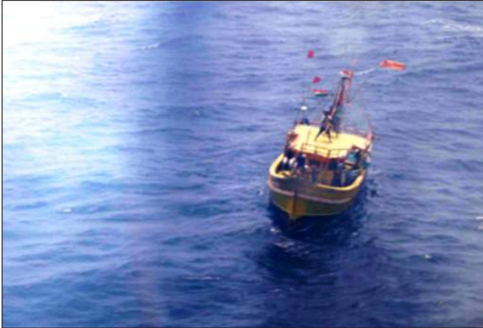
Search and Rescue of lives at sea

position of the boat was immediately passed to ICG Ship Rajkiran in area and the ship was subsequently vectored towards the boat. Notwithstanding the inclement weather conditions, the boat alongwith 06 fishermen was taken under tow and safely brought back to Paradip.