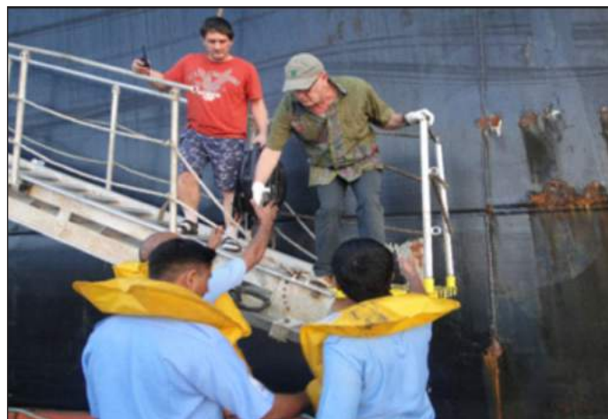
Medical Assistance to Crew of "MV RHL Constantia"

On 26 Nov 15 at 1435 hrs, MRCC Mumbai received an email from 'MV RHL Constantia', (Flag-Malta) for medical evacuation of a crew member in position 236 Mangalore Lt 31 n miles.