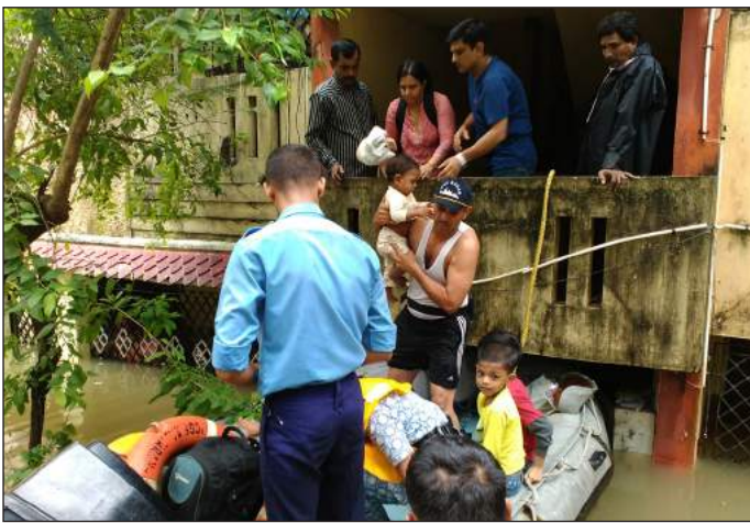
Saving precious lives

VGP Salai and Saidapet areas. The overall status of relief and rescue efforts undertaken by Coast Guard is as follows:-