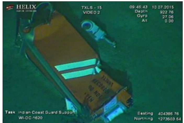
Underwater wreckage of CG 791

What the operation brought out best was the coordination among all SAR resource agencies. In addition to Coast Guard and Navy, Indian National Centre for Ocean Information Services (INCOIS), National Remote Sensing Agency (NRSA), Hyderabad, National Institute of Ocean Technology (NIOT), Subsidiary Intelligence Bureau (SIB), Tamil Nadu and even local fishermen joined the Search Operation. Surface search module was developed by INCOIS with NRSA providing the satellite imagery of the most probable areas. Despite the untiring efforts, the surface search yielded nil success with nil debris found in the entire search area. On 12 Jun 15, the first hope of success in the form of a thin oily-sheen observed on the water surface was also short-lived as the sample was devoid of any oil derivatives. In addition to the Indian Naval Submarine, which was continuously searching the area for any underwater signal, M/s Reliance India Ltd too was approached for services of its state of art Multi Support