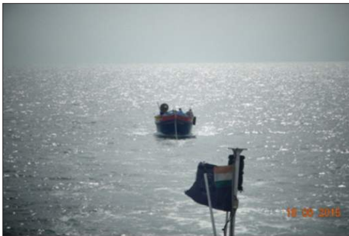
SAR for Adrift FB "Laila"

Technical team Ex-C-426 boarded the boat and concerted efforts were made to provide technical support. However, repairs could not be undertaken view rough sea conditions coupled with heavy swells.