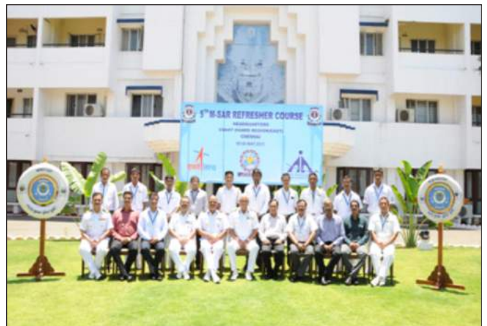
SAR Refresher Course at MRCC Chennai : 04-08 May 15