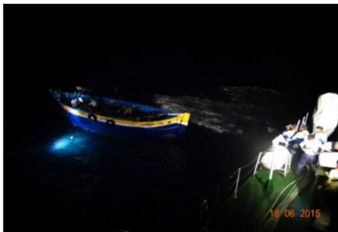
Adrift FB "Vijaya Ragavan"

At about 0900 hrs on 03 Sep 15, Coastal Security Group (CSG), Chennai informed RHQ(E) about adrift fishing boat 'Vijaya Ragavan' in position 07 n miles South East of Porto Nova Light due to engine failure. The boat with 07 crew had ventured into the sea for fishing on 31 Aug 15 from Nagapattinam.