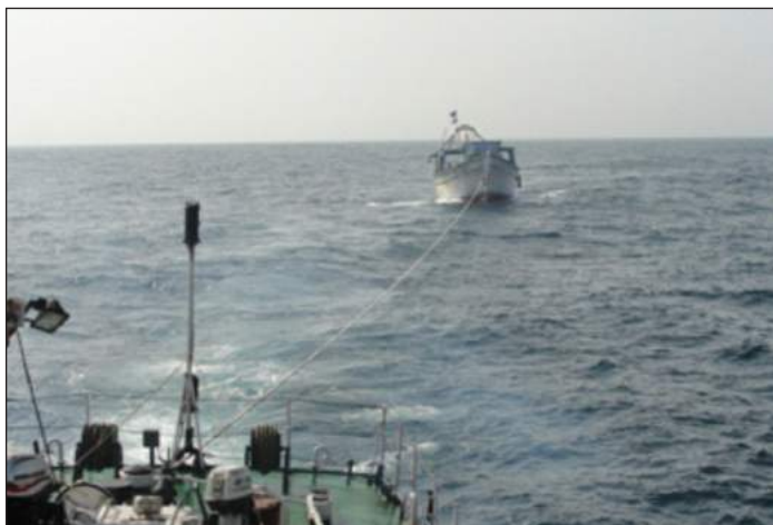
Stranded FB "Sri Master"

ICG Ship C-420 was immediately deployed at 1500 hrs on 30 Aug 15 for search of the adrift fishing boat. However, the boat could not be located. Subsequently, ICG Ship Amartya on routine patrol was diverted at 2205 hrs on 30 Aug 15. At about 0200 hrs on 31 Aug 15, the adrift fishing boat was sighted in position 22 n miles South West off Tadri Light. The boat had been adrift since 28 Aug 15 due to engine failure.