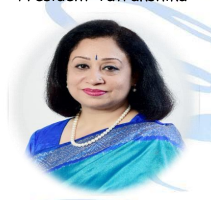
"Plan your work for today and every day, then work your plan".